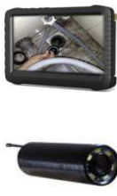
Wireless Infra-Red Camera System