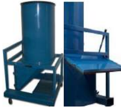
210L Stainless Steel Cylindrical Hopper