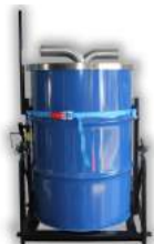
Additional 205L Drum