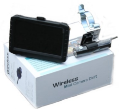
Wireless Camera & Monitor