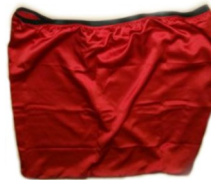
Silk Pre Filter