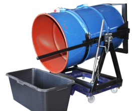
Drum Tipper & Drum Dolly