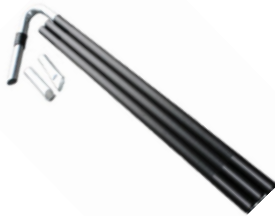
Carbon Fiber Clean From The Ground Kit