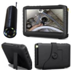
Wireless Camera & Monitor