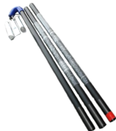
Extra lengths for Carbon Fiber Clean From The Ground Kit