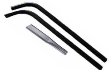
Additional vacuum Tools