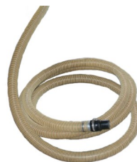
Add Another 5 metres of vacuum hose