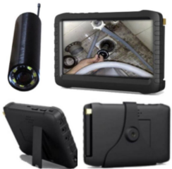
Wireless Camera & Monitor