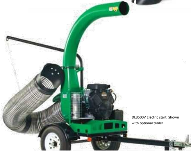
DL3500V Electric start. Shown with optional trailer