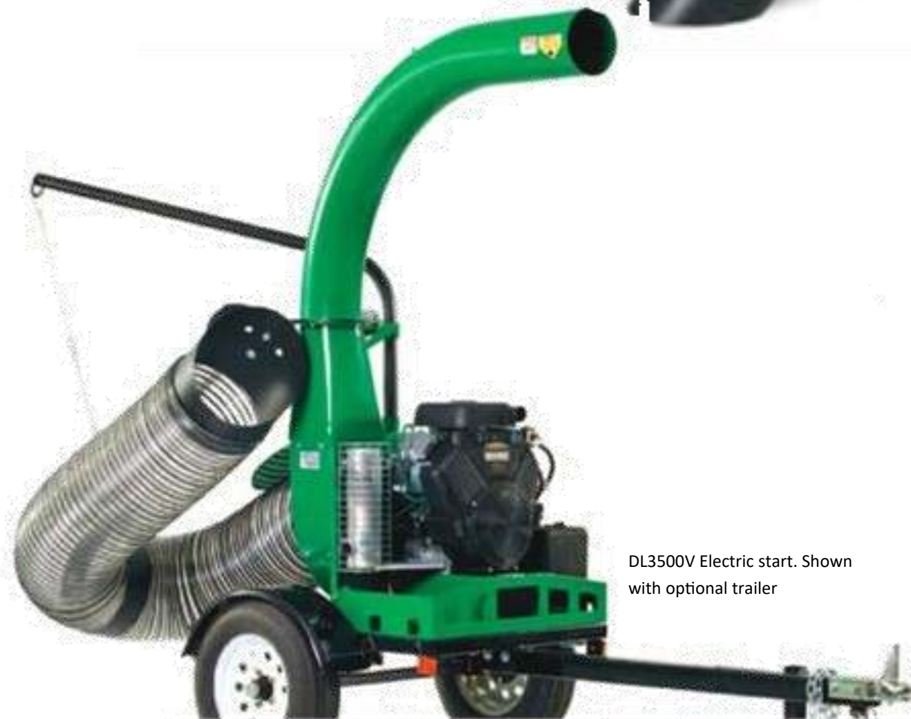
DL3500V Electric start. Shown with optional trailer