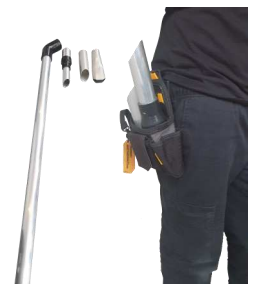
Wand Tool Pouch Kit

Applied Cleansing Solutions Pty Ltd | F2/ 10-14 Tower Court Noble Park VIC 3174