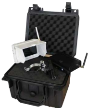
Wireless Camera & Monitor