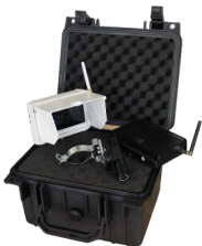
Wireless Camera & Monitor