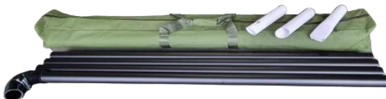
Carbon Fiber Clean From The Ground Kit