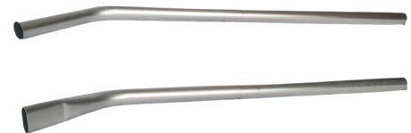
L Rod Crevice & Open End

Applied Cleansing Solutions Pty Ltd | F2/ 10-14 Tower Court Noble Park VIC 3174