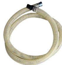
Add Another 5 metres of vacuum hose