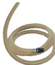
Add another 5 metres of vacuum hose