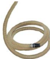
Add another 5 metres of vacuum hose