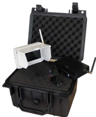
Wireless Camera Kit with carry case