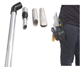
Wand Tool Pouch Kit