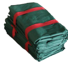
Additional 400litre bio degradable bags