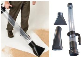
Insulation removal tool