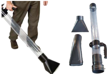
Insulation removal tool