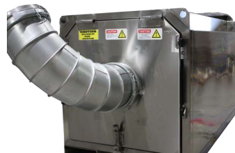
90-degree inlet elbow for boom