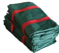
Additional 400litre bio degradable bags