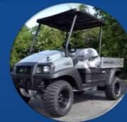
FITS ONTO MOST BUGGIES WITH TIPPING TRAY