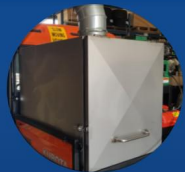
500 LITRE STAINLESS STEEL HOPPER