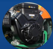
VANGUARD UNLEADED ENGINE