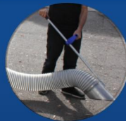
ALLOY LIGHTWEIGHT WAND