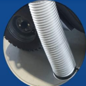
FLEXIBLE LIGHT WEIGHT HOSE 4 MTRS LONG