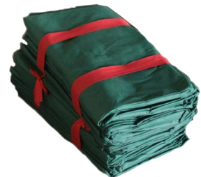
Additional 400litre bio degradable bags