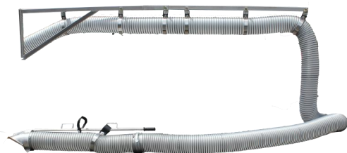
3.5mts long overhead hose