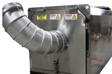
90-degree inlet elbow for boom