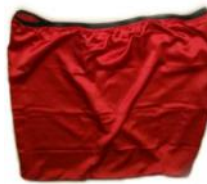
Silk Pre Filter