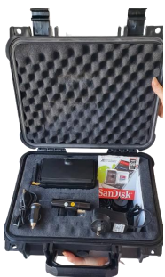
Wireless Camera & Monitor