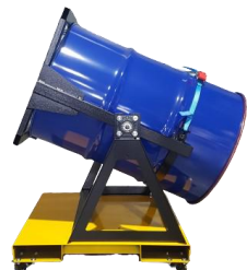
Forklift Pocket Tipping Drum Dolly