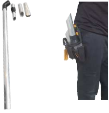
Wand tool pouch kit