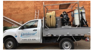
Water extraction system on a removable skid