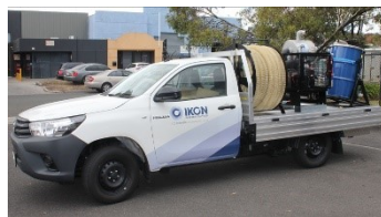
Single cab alloy tray ute