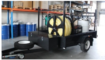
Single axle 8 x 5 trailer