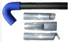
Carbon fiber ground kit tools