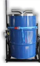
Drum Handling tipper