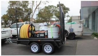
Dual axle 8 x 5 trailer