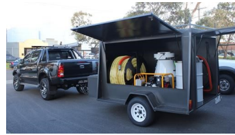
Enclosed single axle 8 x 5 trailer