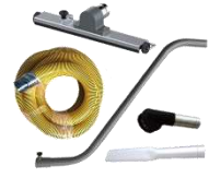
Floor cleaning kit