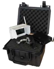
Wireless camera kit