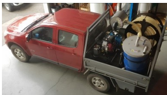
Dual cab alloy tray ute