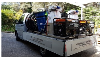
Even two Gutter Master 1530 systems can fit on a VW transporter