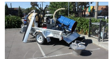
Galvanised single axle trailer

Because we continuously strive to improve our product, we reserve the right to change its specifications without notice. The specifications and options may vary. Our brands, models and products are protected by intellectual property of law.