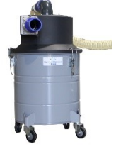
100 Litre Interceptor