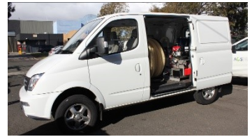
LDV enclosed van