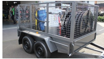
Caged dual axle 8 x 5 trailer