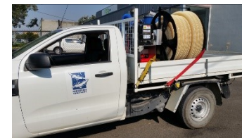
Single cab alloy tray ute