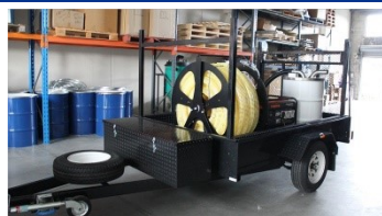
Single axle 8 x 5 trailer