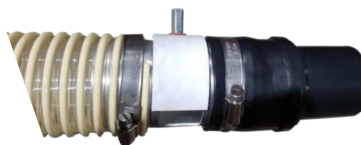
Vegetation release cuff