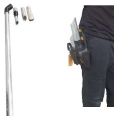
Clean from the roof wand/tool pouch kit