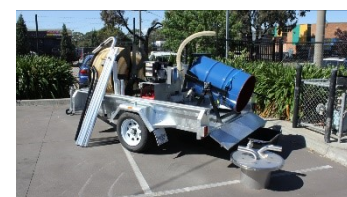
Galvanised single axle trailer

Because we continuously strive to improve our product, we reserve the right to change its specifications without notice. The specifications and options may vary. Our brands, models and products are protected by intellectual property of law.