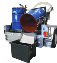
Drum waste discharge chute with bucket