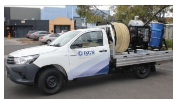
Single cab alloy tray ute