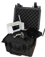
Wireless camera kit