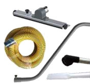
Floor cleaning kit