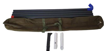
Classic carbon fiber clean from the ground pole kit