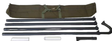
Supreme carbon fiber clean from the ground clamp pole kit