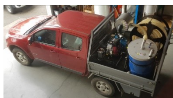
Dual cab alloy tray ute