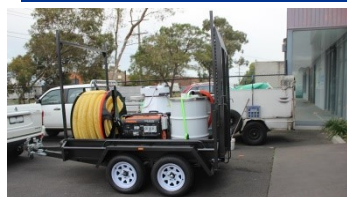
Dual axle 8 x 5 trailer