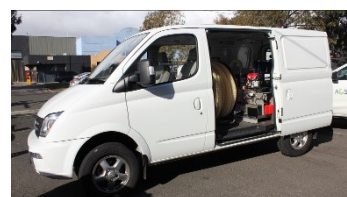
LDV enclosed van