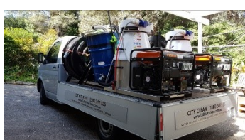
Even two Gutter Master 1530 systems can fit on a VW transporter