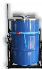
Drum Handling Tipper