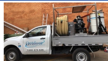
Water extraction system on a removable skid