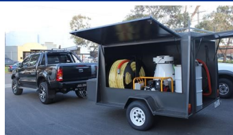
Enclosed single axle 8 x 5 trailer