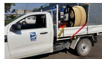
Single cab alloy tray ute