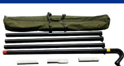
Supreme 50mm OD carbon fiber clean from the ground clamp pole kit