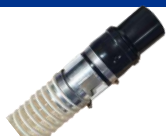
Large item vac release cuff