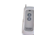
Wireless throttle control system