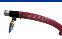
H2O Dust Master Dust suppression system