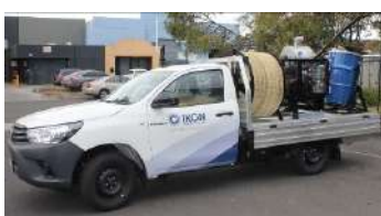
Single cab alloy tray ute