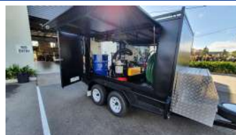
Enclosed single axle 10 x 6 trailer