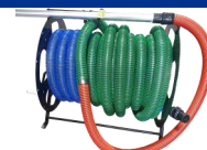
Whip End Flex Hose Kit