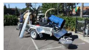
Galvanised single axle trailer

Because we continuously strive to improve our product, we reserve the right to change its specifications without notice. The specifications and options may vary. Our brands, models and products are protected by intellectual property of law.