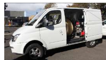
LDV enclosed van