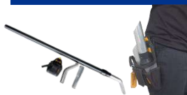
Clean from the roof wand/tool pouch kit