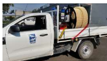
Single cab alloy tray ute