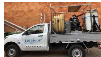
Gutter Master™ removable skid