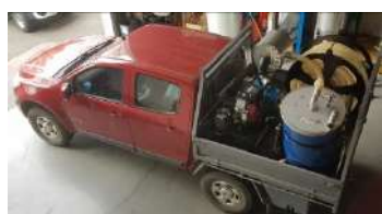
Dual cab alloy tray ute