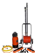
Solar Panel Cleaning Kit