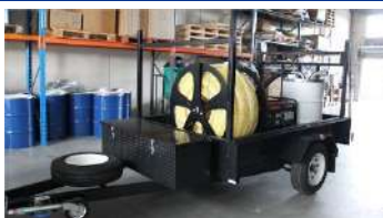
Single axle 8 x 5 trailer