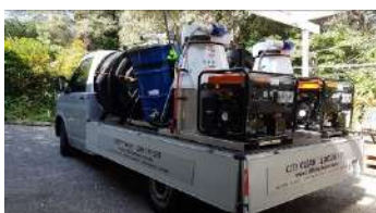
Even two Gutter Master 1530 systems can fit on a VW transporter