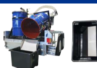
Drum waste discharge chute with bucket