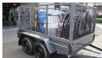
Caged dual axle 8 x 5 trailer