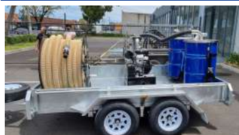
Dual axle 10 x 6 trailer